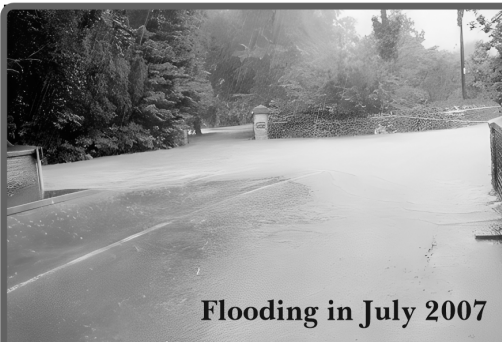
Flooding in July 2007

Just email richard@naturalbest.co.uk to signal your willingness to join the Village Hall Lottery for 2026, and we will email you the details.